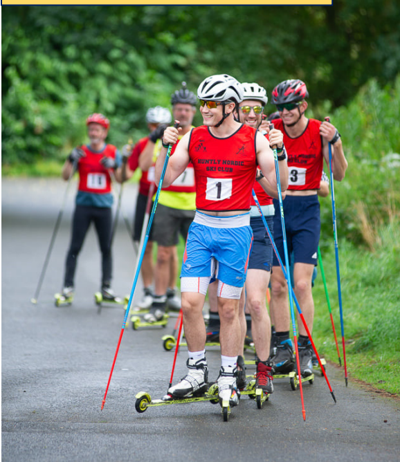
How long did the faces stay smiling??? A relaxed atmosphere for the Senior Men's 7.1km.